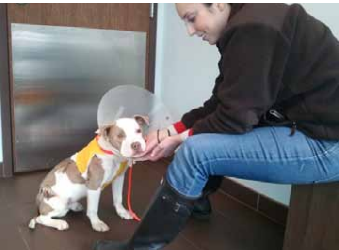
VOLUNTEER AT HIGGINS ANIMAL CLINIC WITH GORDON, A PUPPY THAT SUFFERED SEVERE CHEMICAL BURNS

I HAVE TRAINED MANY OF THEIR ADOPTED DOGS AND THE OWNERS CAN'T SAY ENOUGH ABOUT HOW SUPPORTED THEY FELT THROUGH THE WHOLE ADOPTION PROCESS AND EVEN AFTERWARD.